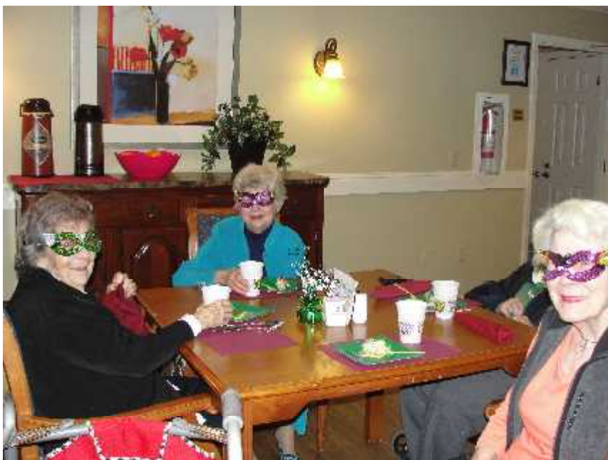
The Mardi Gras King and Queen of the South (Magnolia, Oak & Pine)